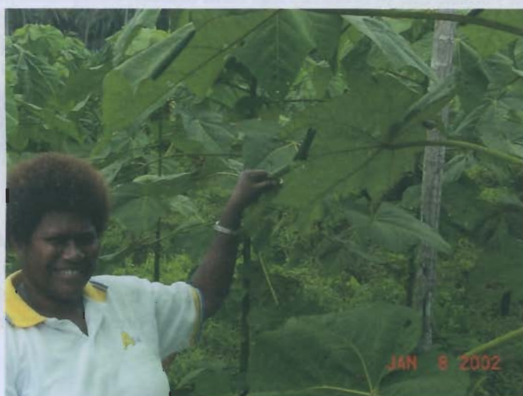
Plate 14: Leaf Roller infestation