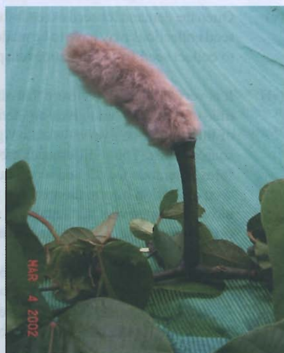
Plate 1 (D)

Plate 1 (A) Open flower and young flower bud. ( style and anthers project above the flower ). Plate 1 (B) Top view of open flower showing style and anthers. Plate 1 (C) Green pods ( Not ready for collection ). Plate 1 (D) Pod ripe with kapok emerging ( This is ready for collecting and can fall to the ground at this stage ).