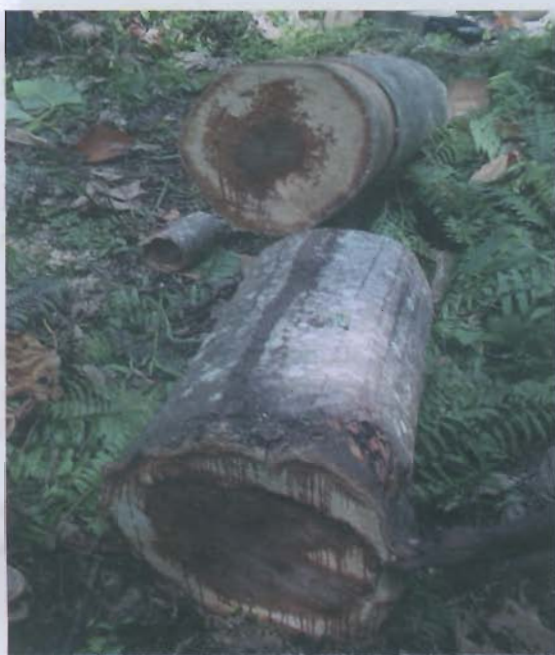
Plate 11 (C)