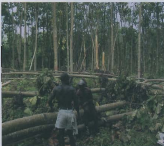
Plate 9: Severe wind throw in orchard due to poor root system on wet site (Note, wind firm seed tree at back left)