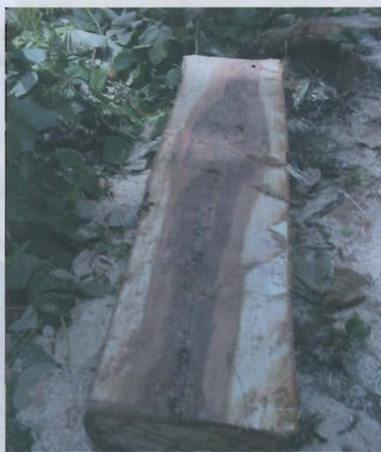
Plate 11 (D)

Plate 11 A-B: Tree infected by pathogens through the root. The cambial region on left side of the tree is dead and the bark has split with weeping sap in live section. Insect attack is secondary.