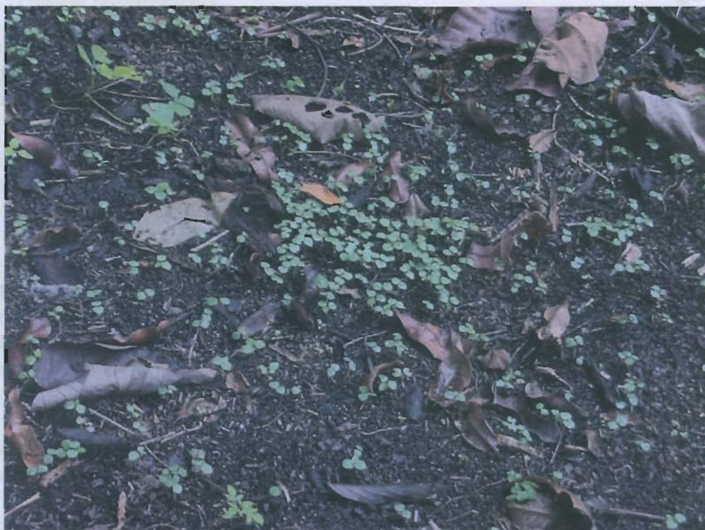
Plate 7 (A)