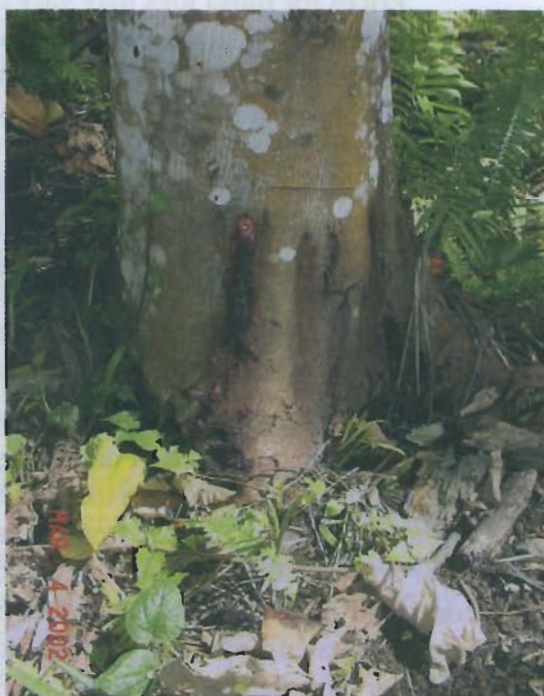
Plate 13: Longicorn infestation of butt a 4 year old tree.