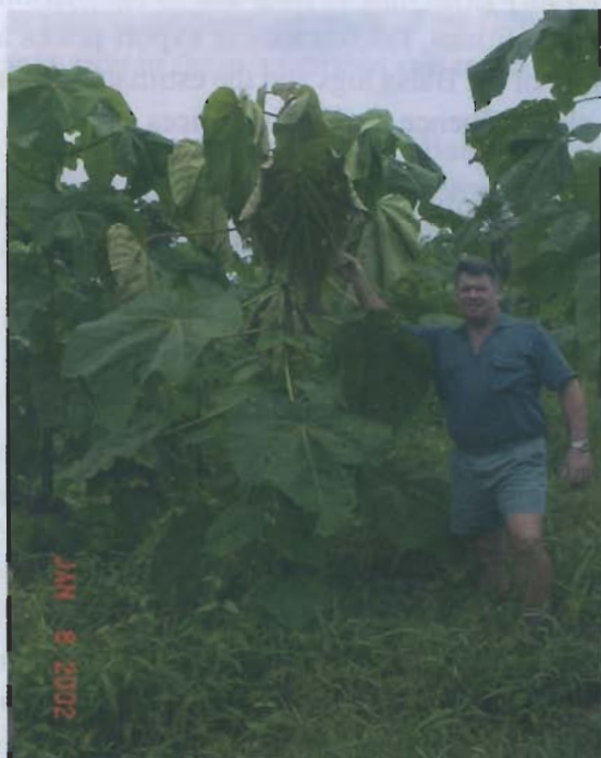
Plate 12: Longicorn attack on stem of 3 month old balsa causing top death

The grub of this pest cuts and rolls a tubular nest from the margins of the leaf. So far this has not proved to be a serious pest and often appears mainly to be associated with young trees on poor sites.