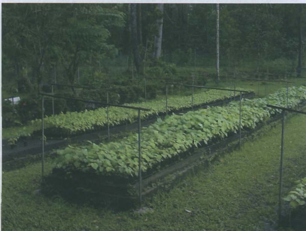
Plate 6 (B)

Plate 6 (A) General view of the Keravat Forestry ITTO Balsa Project Balsa nursery under sarlen shade. Plate 6 (B) Stand out bed with shade cloth removed to condition seedlings to direct sun light and to harden them up for planting in the field. (note cement base, the wooden frames supporting the wire mesh and the support pipes to hold up the shade cloth. The support wires are not visible).