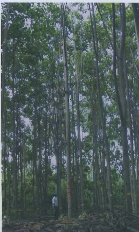
Plate 2 (A)

Short stems (less than 4 metres), terminating in 2 to 3 large branches should not be considered. In most cases, one of the three branches will continue to grow as part of the main trunk and usually such trees will produced a bole with a succession of easily detected kinks and sweeps and large branch stub occlusion scars.