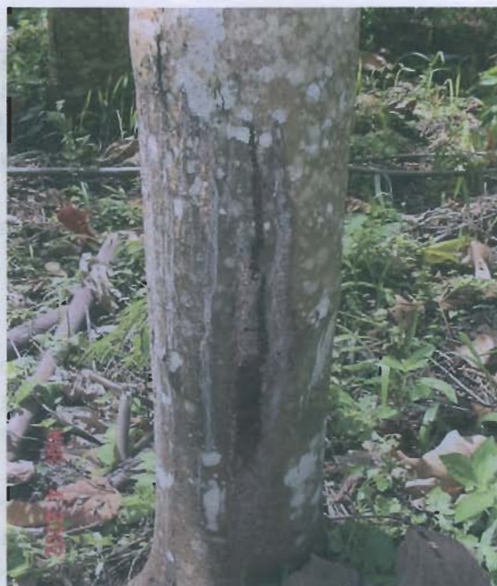
Plate 11 (B)