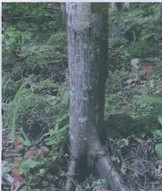
Plate 11 (A)