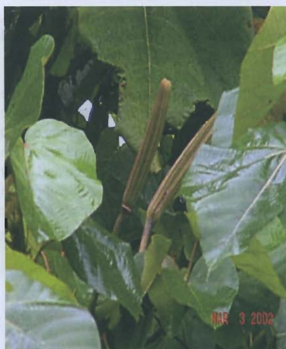
Plate 1 (C)