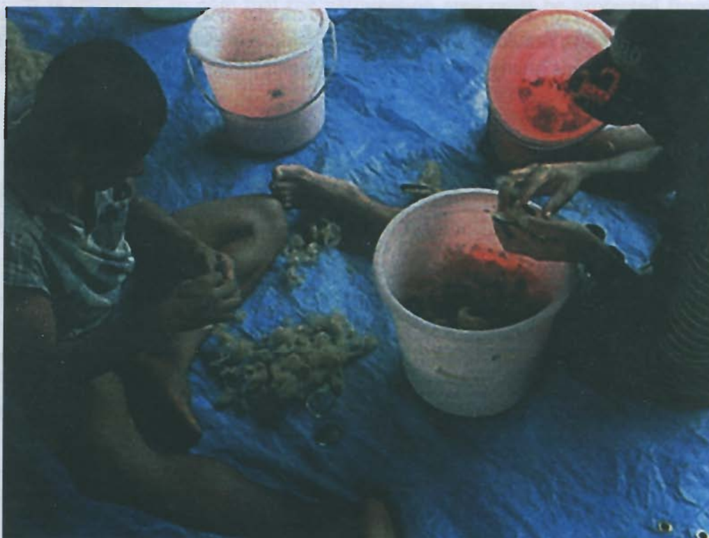
Plate 3 Extraction of seed bearing Kapok from Balsa pods prior to flailing to remove seed from Kapok