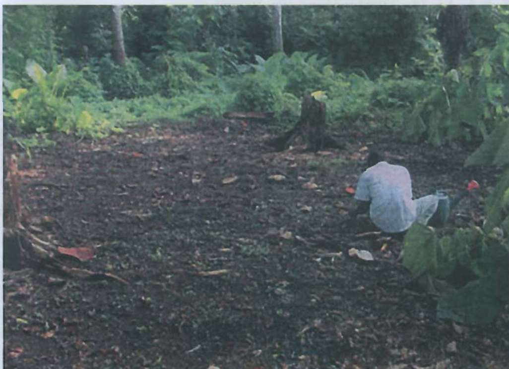
Plate 7 (B)

Plate 7(A) Seedlings germinating in a bush nursery and ready for transplanting in tubes in the Balsa nursery. Plate 7(B) Collecting seedlings from a bush nursery.