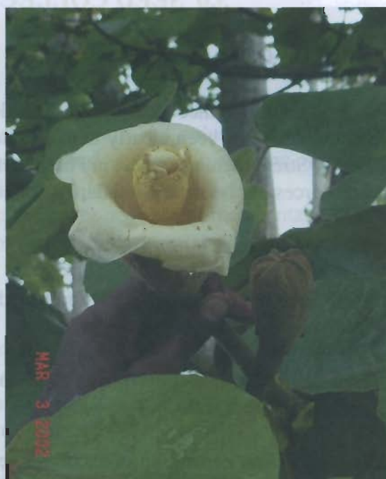
Plate 1 (B)