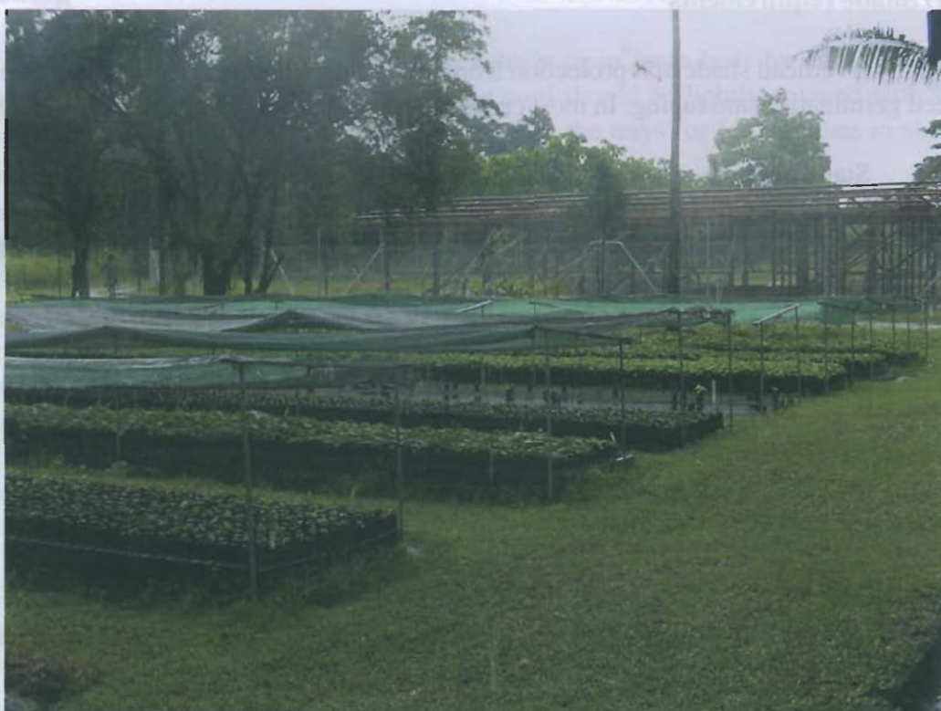
Plate 6 (A)