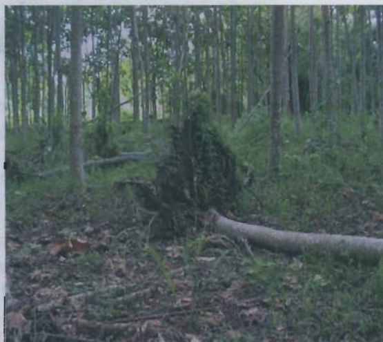
Plate 10: Tree blown over on poorly drained site in orchard at Keravat. (Note, wind firm seed tree to left)