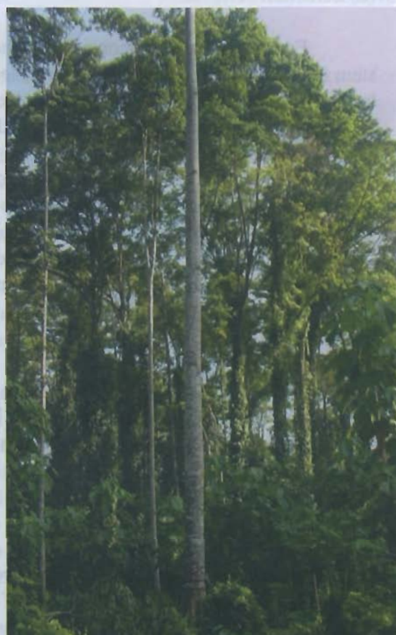
Plate 2 (B)

Plate 2 (A) Balsa seed trees selected for vigour, age 4 years. Note good internode length. Plate 2 (B) Balsa seed tree selected for vigour and good stem form.