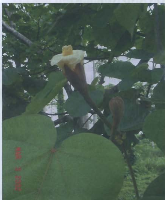
Plate 1 (A)