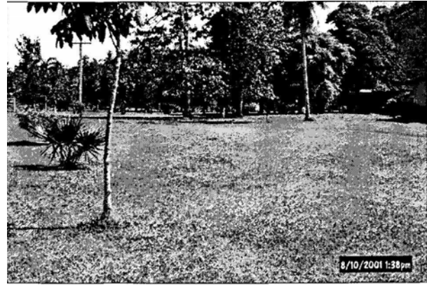
registrar on the information provided.